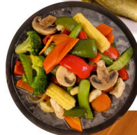
Vegetable Chop suey