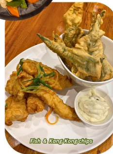
Fish & Kang-Kong chips