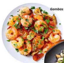
Gambas Al Ajillo

PORK SISIG 380 ★ A Filipino classic: braised and grilled pork meat and liver seasoned with calamansi and chili