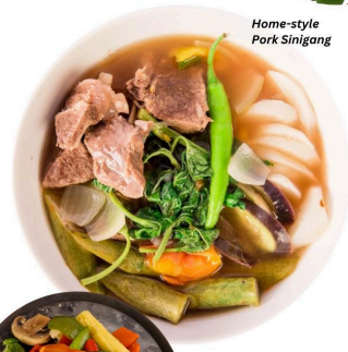
Home-style Pork Sinigang

Battered fish fillet and crispy water spinach with butter and caper sauce